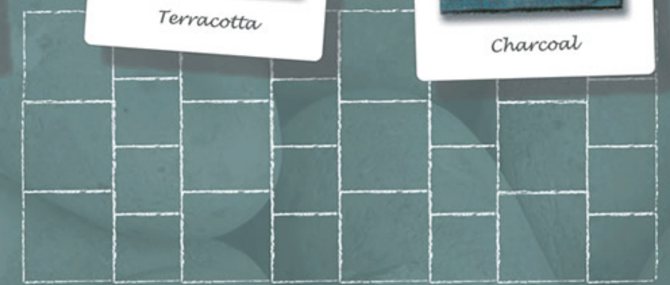
Combination of 600 x 600mm & 450 x 450mm