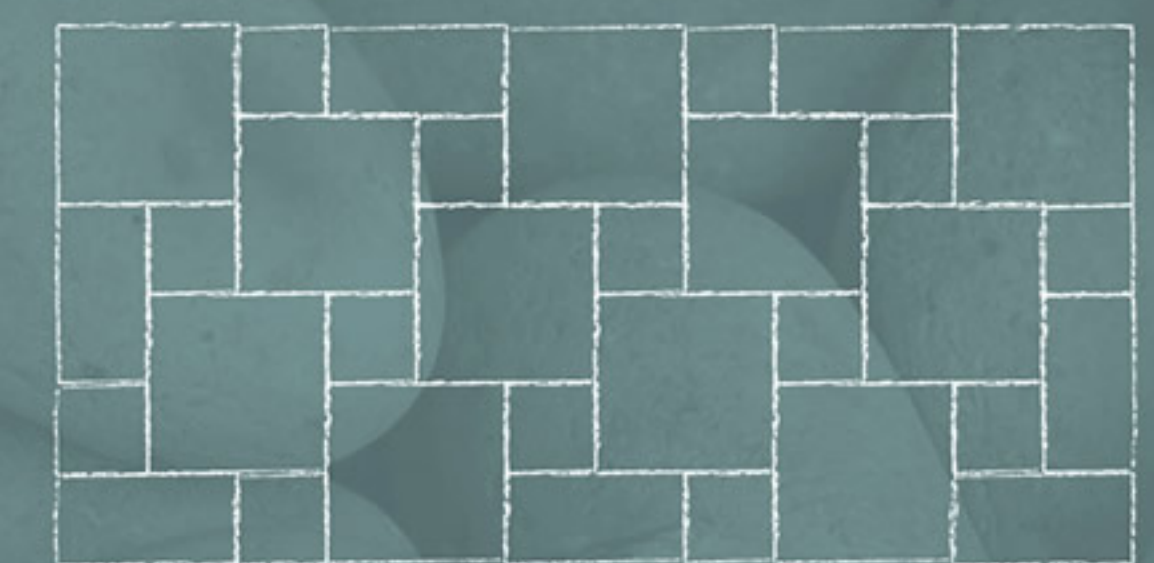
Combination of 600 x 600mm & 300 x 300mm