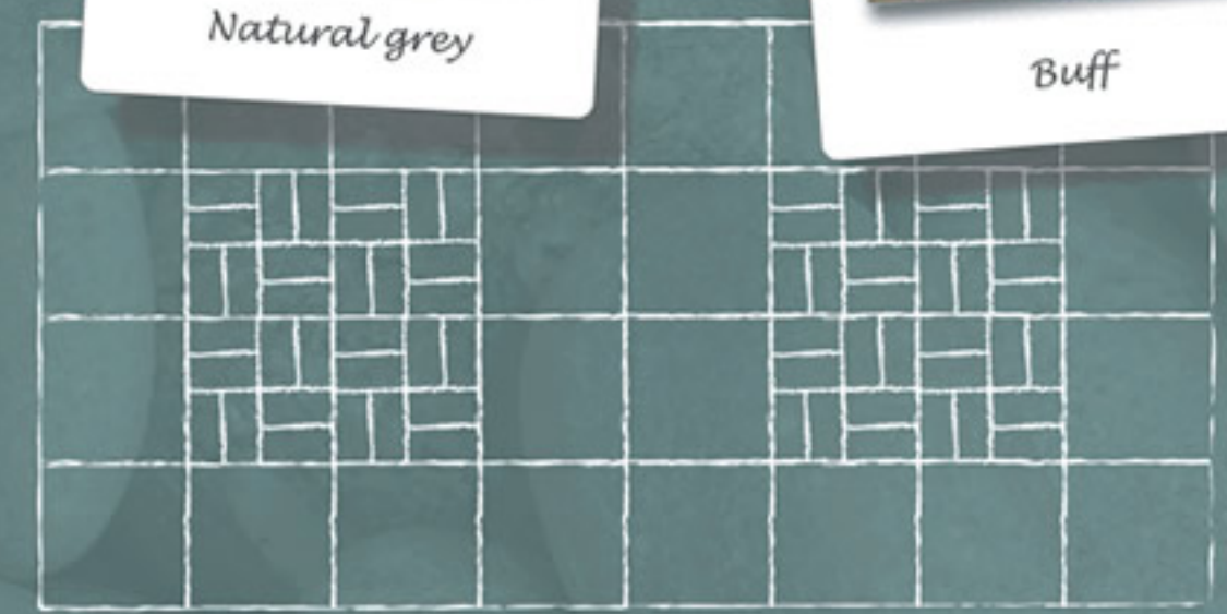
Combination of 450 x 450mm & 450 x 450mm Athenia