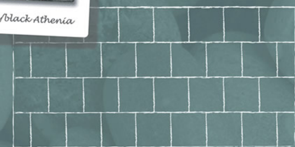
Staggered joint using 450 x 450mm slab